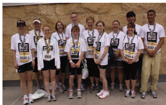
Butler Christ UMC's 2011 Marathon Team