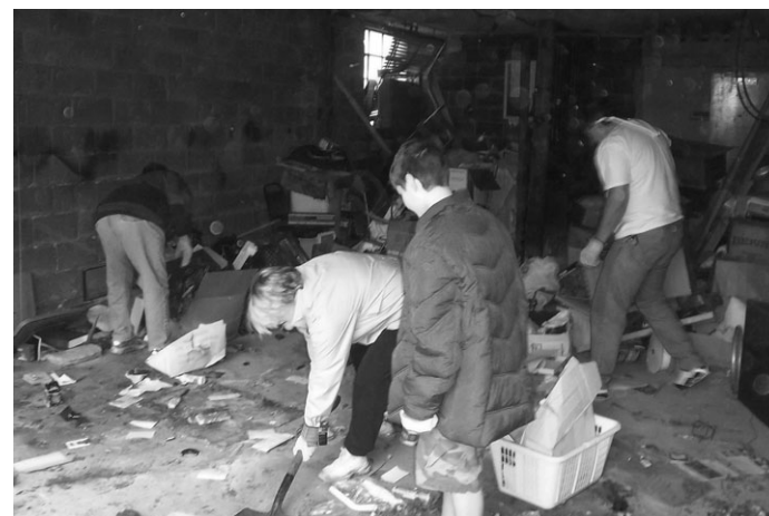
First Bethel team shovels debris from SHIM garage.

Absolutely. The spiritual component is primary. We will continue to encourage families to pray about their decisions and for God's will for their church. In fact, as we have discovered so many times in past campaigns, any good campaign is not just about the money. Congregations often grow together in so many different dimensions when a campaign is spiritually based. This is a definite advantage for those congregations that have used the Foundation's services previously, and for those that will use Growing Faithful Ministries in the future.