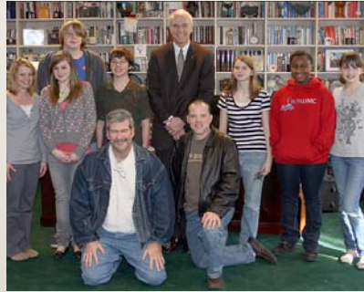
Confirmation Tours at WPA Conference Center - register online at www.wpaumc.org